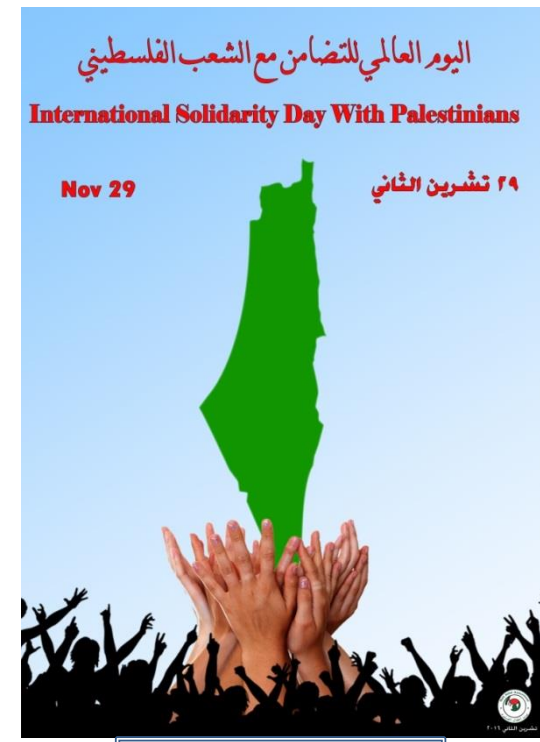
Poster for the occasion